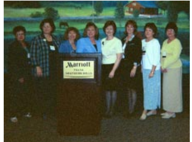
KBEA members from Kansas take a moment to pose for the camera at the 2004 M-PBEA Conference.